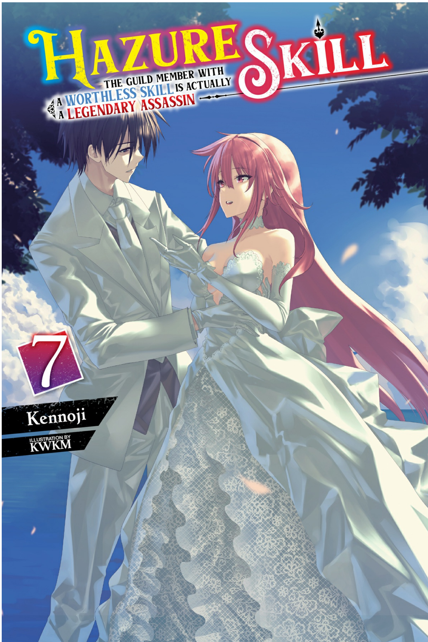
ILLUSTRATION BY KWKM